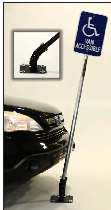
* Sign Sold Separately *