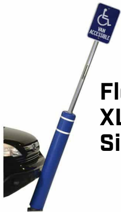
FlexPost® XL-B52/8 Signpost